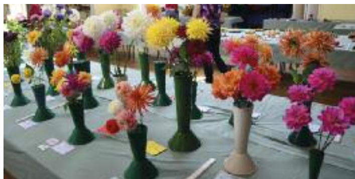
The Dahlia entries