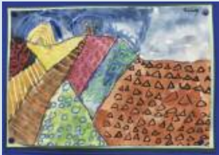
Year 2 visited Durlieghmarsh Farm to find out where food comes from. They picked fruit, made smoothies and painted some beautiful pictures in the style of David Hockney. Years 2 and 3 then wrote poems and prayers, and led the Harvest service.