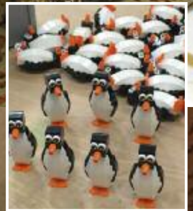
Back cover picture courtesy of Mari Wallace