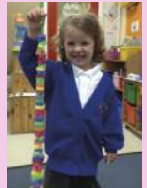
The children in Reception classes have settled in really well and have enjoyed their first days at school.