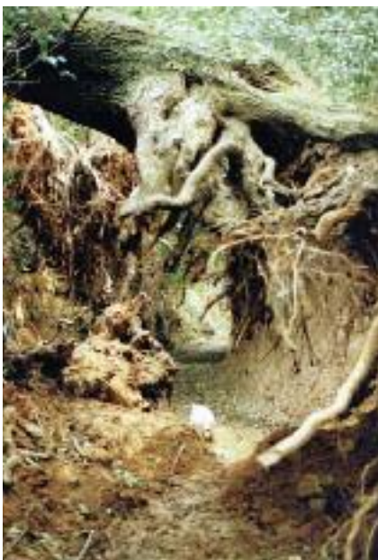
Rectory Lane after the 'Great Storm' before the army moved in to clear it.

With most of the services out, people were reduced to an almost medieval existence and barbeques and camping gas hobs were dug out to heat water and cook the contents of deep freezers that