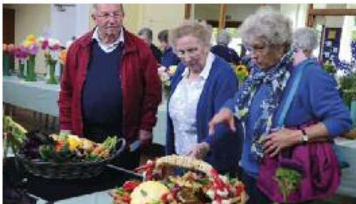
Admiring the baskets of vegetables