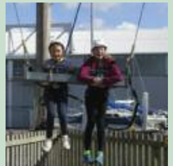
Year 6 enjoyed visiting Calshot residential centre where they used their growth mindset and showed a lot of resilience when taking part in a range of activities.