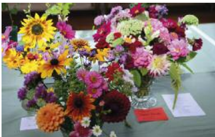
The mixed cut flower class